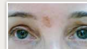
BEFORE (1-Year Post Laser Treatment)