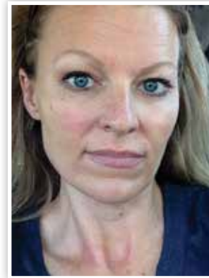
20 MINUTES POST-TREATMENT

“On average, people require 1 — 3 days after Micro-needling for the heat and redness to subside. Recovery, as a part of Micro-needling treatment, reduces healing time down to less than 1 day and often within hours of the treatment.”