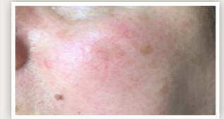
AFTER ONE TREATMENT